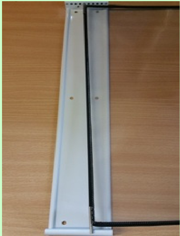
Insert Top Metal Section Metal top section has now been inserted