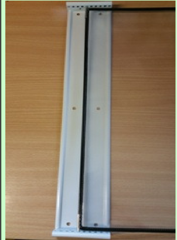
Insert Bottom Metal Section Metal bottom section is now inserted